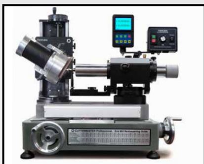
Digital Read Out