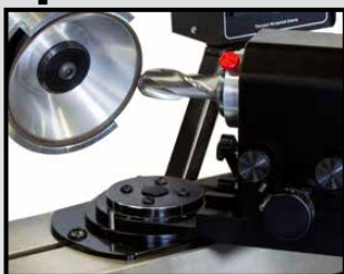
Corner Radius (Bull and Ball)