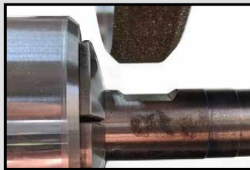
Set Screw Flats / Chamfers / Neck Reduction