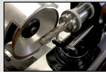
Easy Ends and Flutes