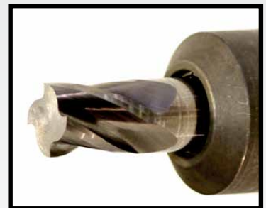
Grinders for End Mill Ends, Corner Radius (bull nose), Carbide Cut Off, Neck Reduction, Drill Points

Engineering and Prototyping - 2353 Ridgcrest Place, Ottawa ON K1H 7V4 Manufacturing and Distribution - 810 Proctor Ave, Ogdensburg NY 13669 Call us 1 (800) 417-2171