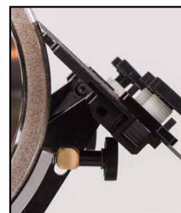
Micro-Adjust Feed Rest