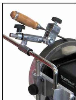
Tormek Attachments on wheel or belt