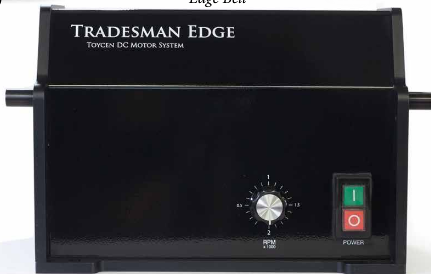
Base machine without wheels or work rests