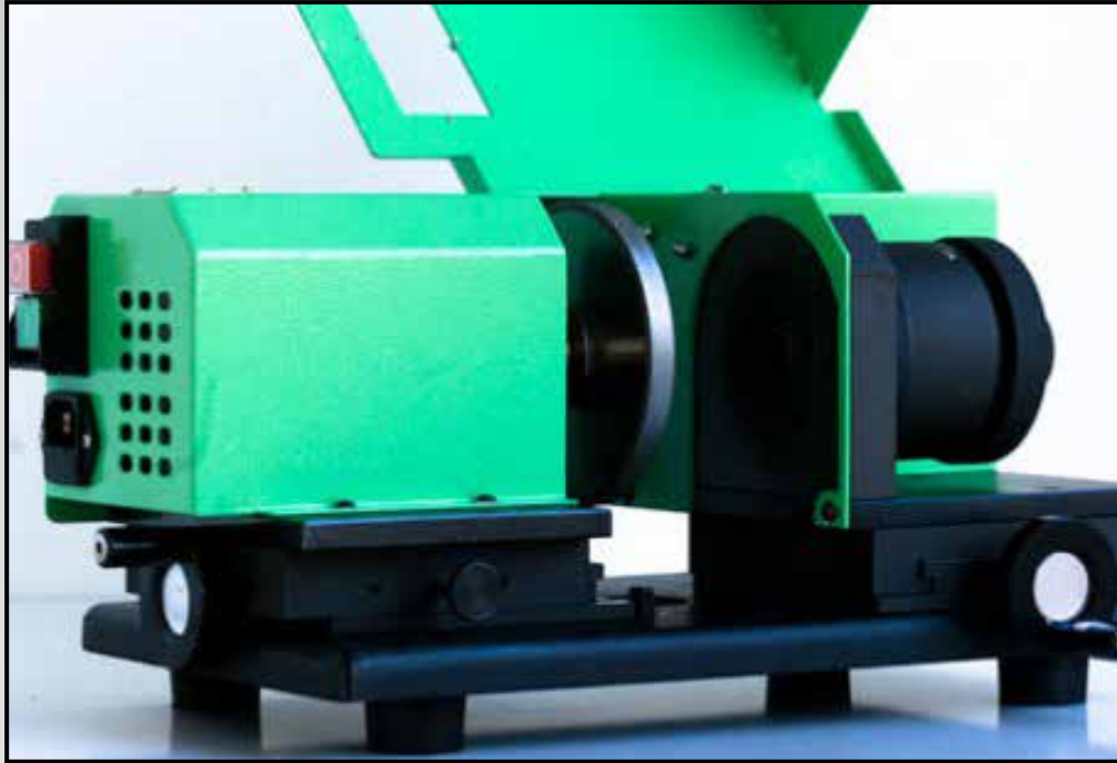
GS-13N with Necking Wheel