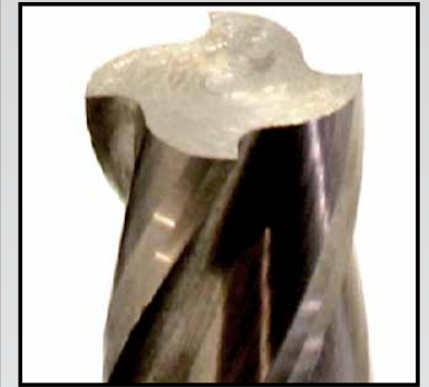
Cut off end mill