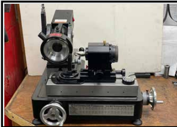
Use on any grinder with T-Slot