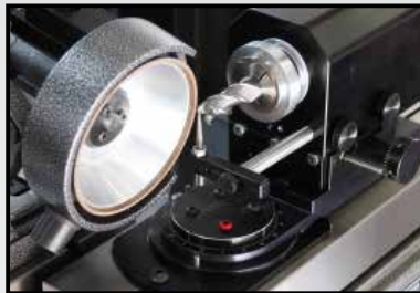
End Mill Ends and Flutes