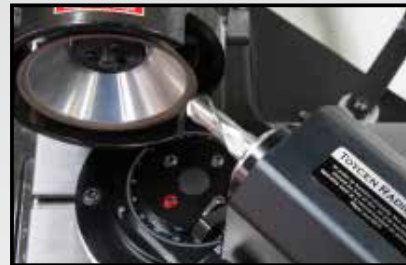
Ball Nose Bull Nose

Grind any bull nose or ball nose corner radius with the Radius Air Bearing, as well as other features such as ends and flutes.