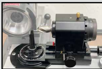
Corner Radius and Ball Nose