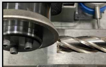
Easy Center Cutting Ends