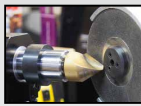
Countersinks / Step Drills