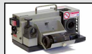
EC313 Drill Grinder 3-13mm