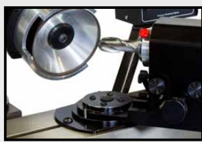
Bull Nose / Ball Nose Corner Radius