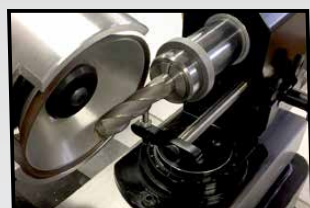
Easy Ends and Flutes