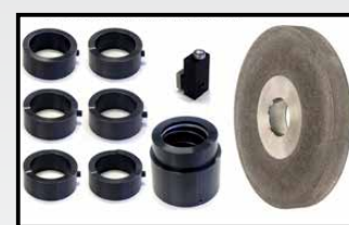
Countersinks / Step Drill Cam Set

CM-01P Tool Grinder complete with Toycen Universal Base, Toycen MK2 Radius Air Spindle, Toycen Variable Speed, Reversing Infinite Twin Whisper Drive DC Motor Tower and Control, Machine Stand / Cabinet, EC313 1/8-1/2in Precision Chuck Drill Grinder, 7 Piece 5C Collet Set, Maintenance Tool Set, Operators Manual, CBN and Diamond 11V9C Advanced cup wheels, Spindle Mounted Braked wheel truing device, Toycen book on end mills, Journeyman Countersink and Step drill cam set CM10S Bench Storage Cabinet. $10,645.00