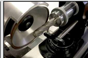
Easy Ends and Flutes