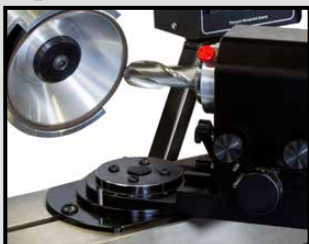
Corner Radius (Bull and Ball Nose)