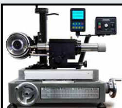
Digital Read Out