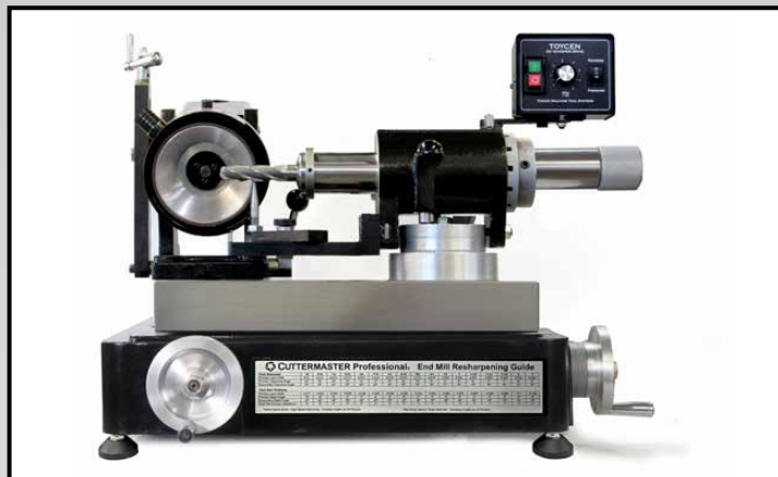
Easy Flutes and Ends