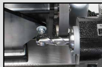
Reduced Neck Grinding