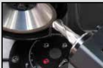
Corner Radius and Ball Nose