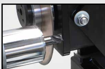
Tool Cut Off