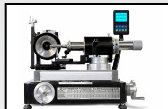
Digital Read Out