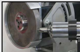
Countersink ,Chamfer Tool Sharpening