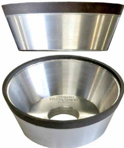
CM-30 and CM-31

CM-30 5" Diameter x 1-1/4" Arbor, 120 grit diamond resin bond CM-30-500 5" Diameter x 1-1/4" Arbor, 500 grit diamond resin bond CM-31 5" Diameter x 1-1/4" Arbor, 100 grit CBN resin bond