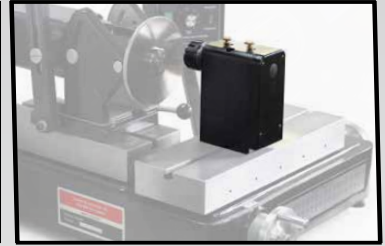
CM-ER32M Motorized Spindle