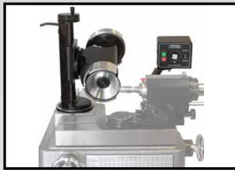
CM-UT Twin Tower