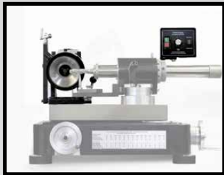
CM-JX Basic DC Motor