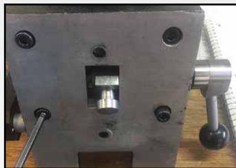
JX-Upgrade Modified Motor Lock Nut