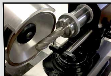
Easy Ends and Flutes