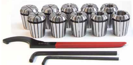
Five piece collet set