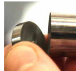
Tool cut off