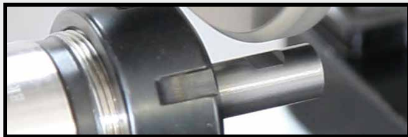
Set Screw Flat, neck Reduction and carbide cut off

The CUTTERMASTER was not designed with set screw flats or neck reductions so we created this fixture to make these operations possible. The z-axis adjustment allows the tool to be held below the wheel so that truly flat, Weldon set screw flats can be achieved. Use this fixture for necks and cut off as well as to avoid wearing out your air spindle.