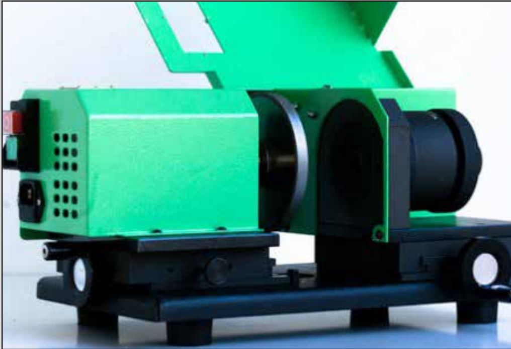
GS-13N with Necking Wheel