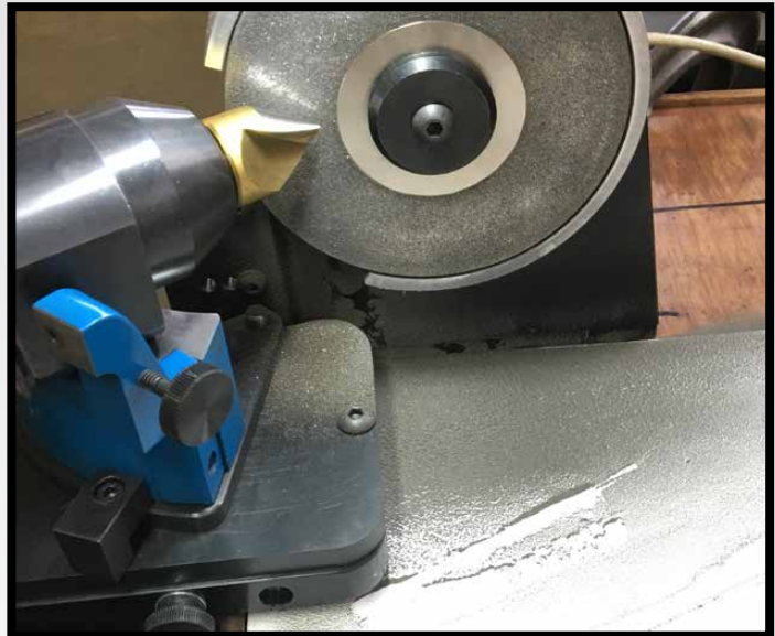
Six Inch Face Wheel on Tradesman

Engineering and Prototyping - 2353 Ridgcrest Place, Ottawa ON K1H 7V4